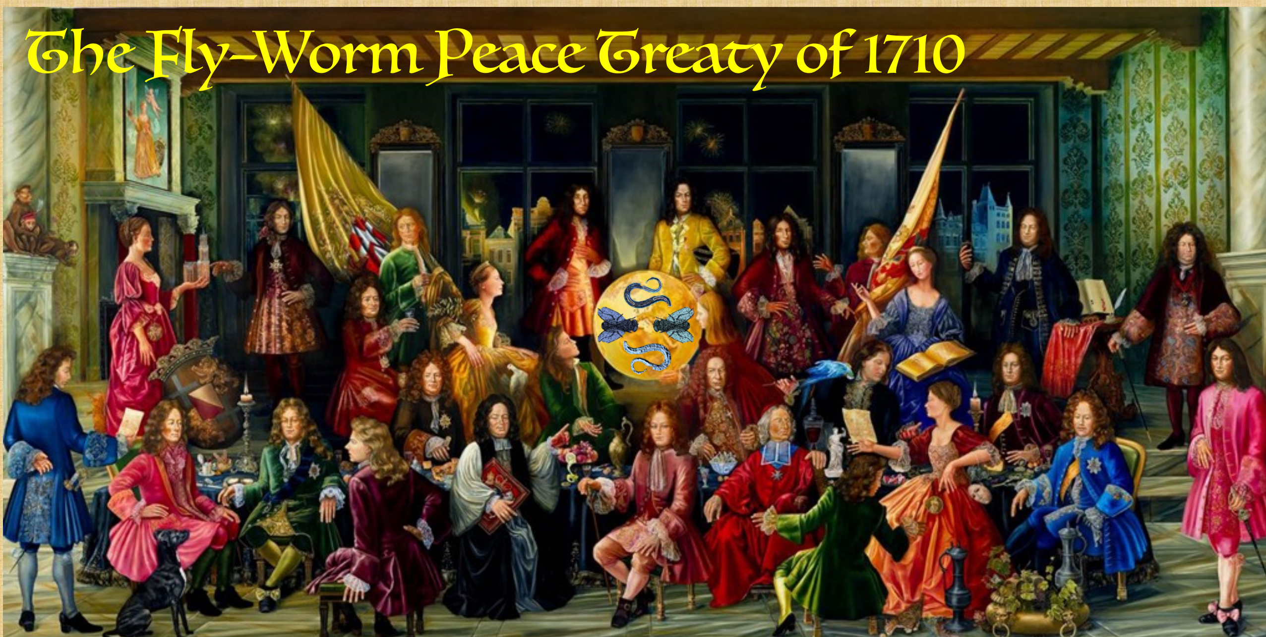
The Fly-Worm Peace Treaty of 1710