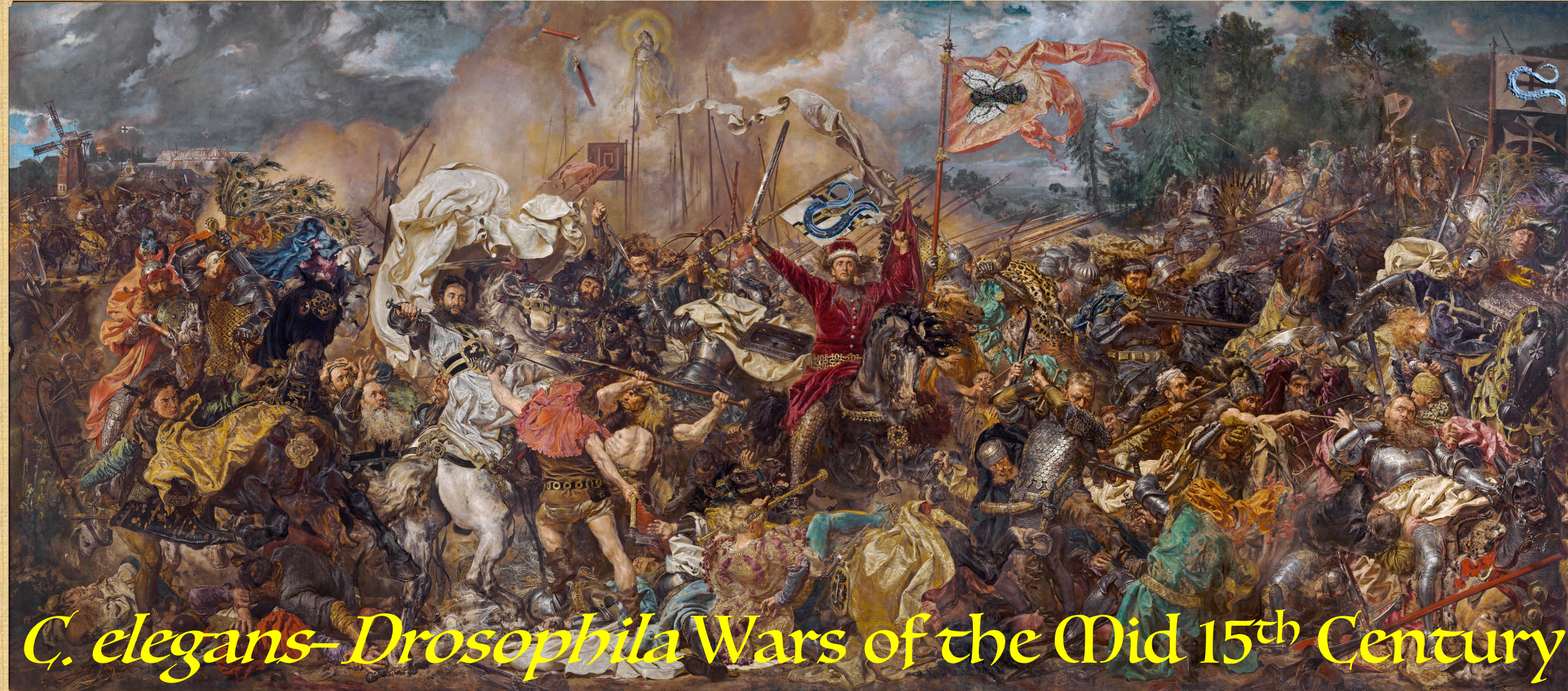
C. elegans- Drosophila Wars of the Mid 15 th Century