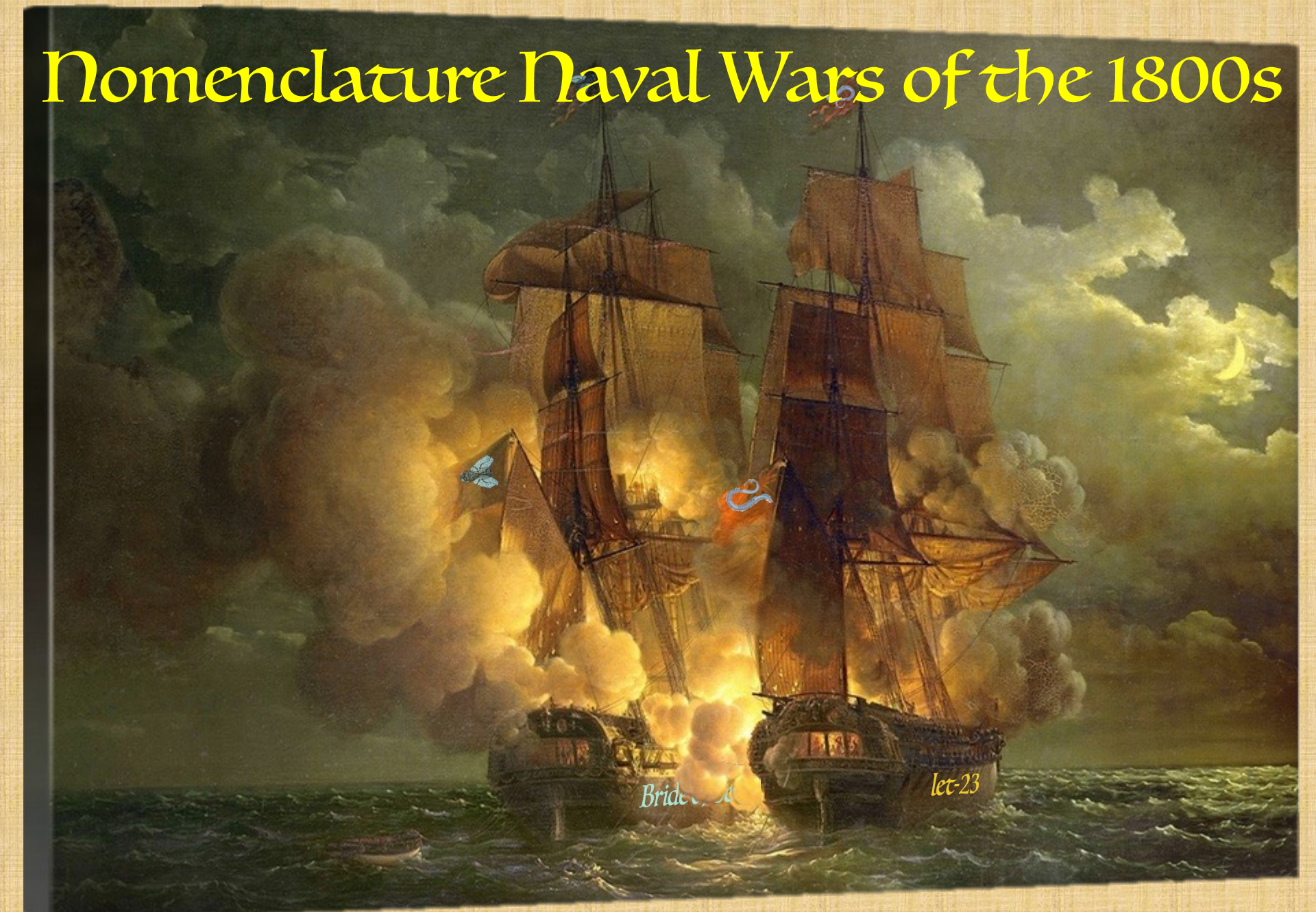
Nomenclature Naval Wars of the 1800s

Some have argued the mysterious insignia on the shoulder of Gavriilo Princip(al Investigator) as evidence that Xenopus researchers were in fact responsible for inciting early 20th century worm-fly conflicts. This theory remains controversial.